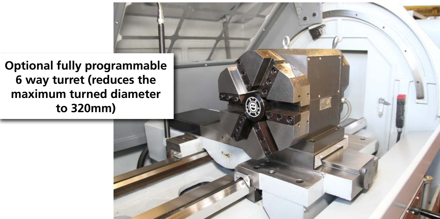
Optional fully programmable 6 way turret (reduces the maximum turned diameter to 320mm)

Dugard Lunan 800MF 400mm 3 jaw chuck - std 500mm 4 jaw chuck - opt