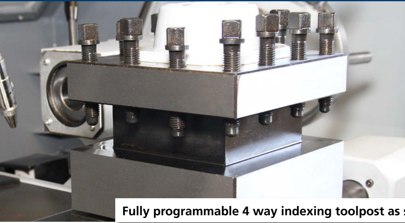
Fully programmable 4 way indexing toolpost as standard

Fully guarded ball screws, extra wide double box way bed design for high rapid traverse and the capability to carry heavier work loads. The bed is also designed to allow easy unobstructed chip flow into the swarf tray or optional chip conveyor