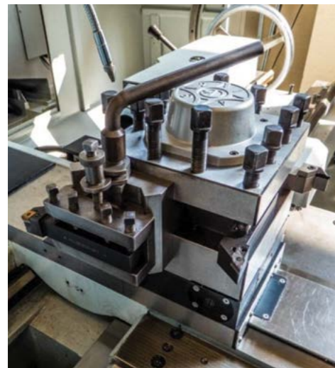
Optional adaptor to hold Q/C holders in position and manually change tools